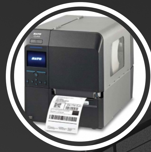
THARMAL PRINTING UNIT