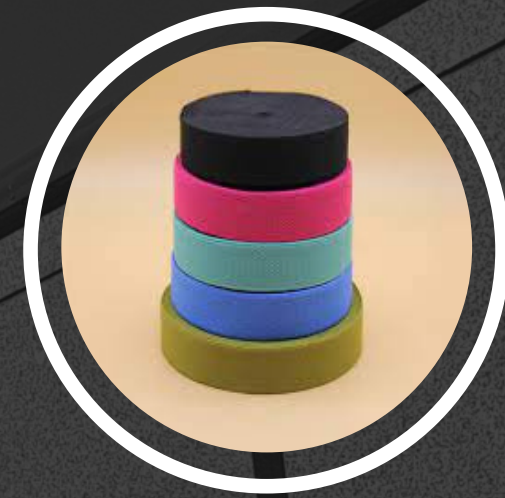
TWILL TAPE UNIT