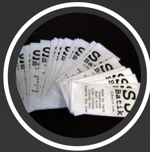
PRINTED LABEL UNIT