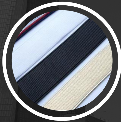
ELASTIC & LACE UNIT